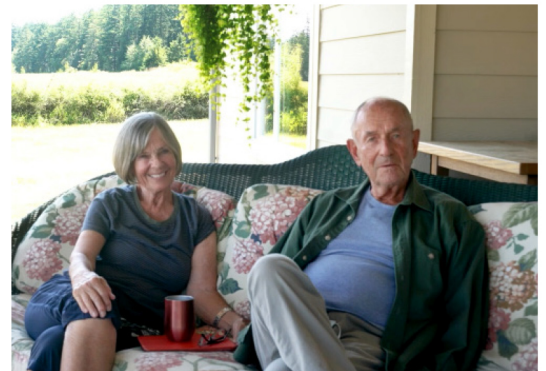
Home Tour 2020

We're building on what 2020 made clear: Lopez Center is a place to be part of some- thing bigger than ourselves.